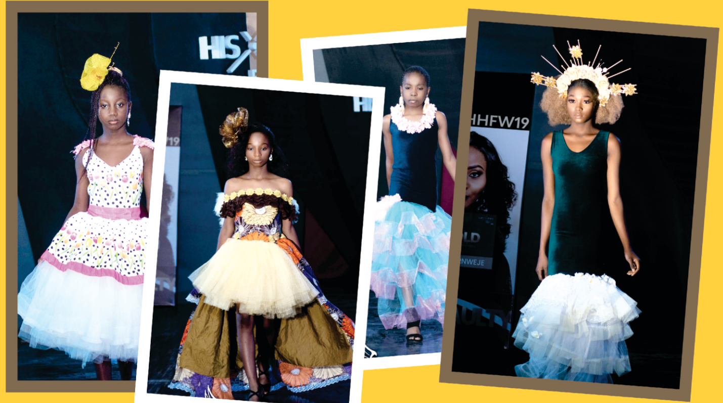
Dee Bonitas @deebonitascouturestudio