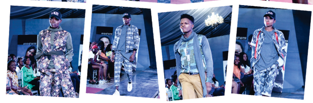
House of LEON @house_leon